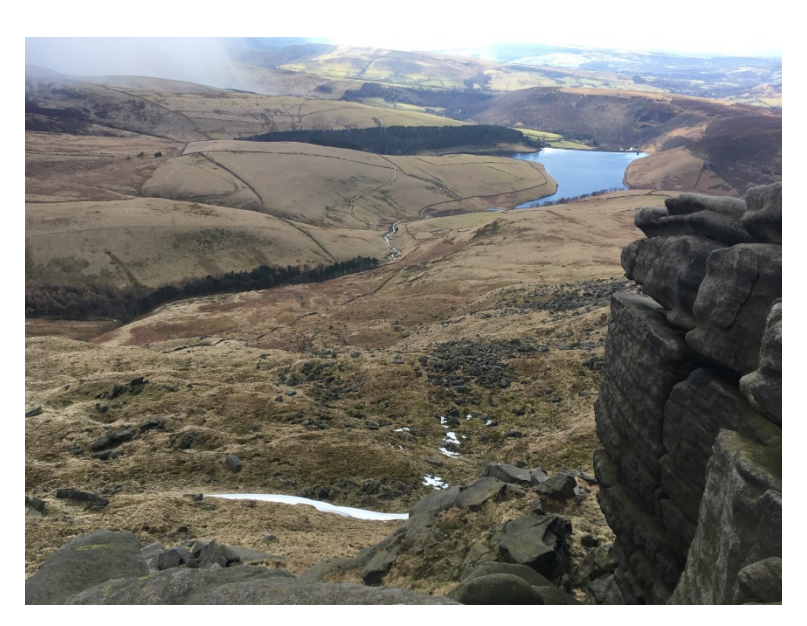
Figure 1. Evidence of technology in the natural landscape (McLain, 2018)

Curriculum can be viewed and understood through different theoretical lenses, each with their own drivers, such as aims (Reiss & White, 2013), knowledge (Young, 2008) and experience (Biesta, 2014). In these politically turbulent times for D&T in England, we adopt a pragmatic stance (Biesta, 2014; Biesta & Burbules, 2003; Dewey, 1966, 1944, 1916) side stepping the whole knowledge verses skills debate and focusing on experience and the interaction between mind and hand (Kimbell et al., 1996). We do not argue for a new curricular hegemony, dethroning knowledge and reinstating skill, but a more nuanced and accommodating political climate with regard to curriculum and pedagogy – both the 'Big P' of national and the 'small p' of local policy and practice.